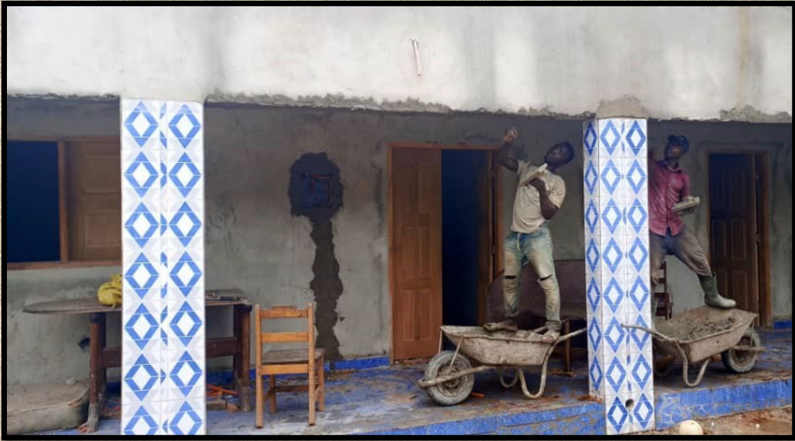
Workers balance on wheelbarrows to stucco the ceiling!

Construction of the new boys' dormitory continues and should be completed in July.